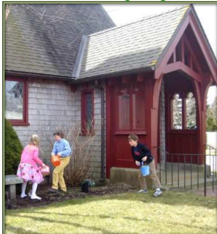
Alleluia, Christ is Risen!

A newsletter of Christ Church Episcopal-Harwich Port, MA