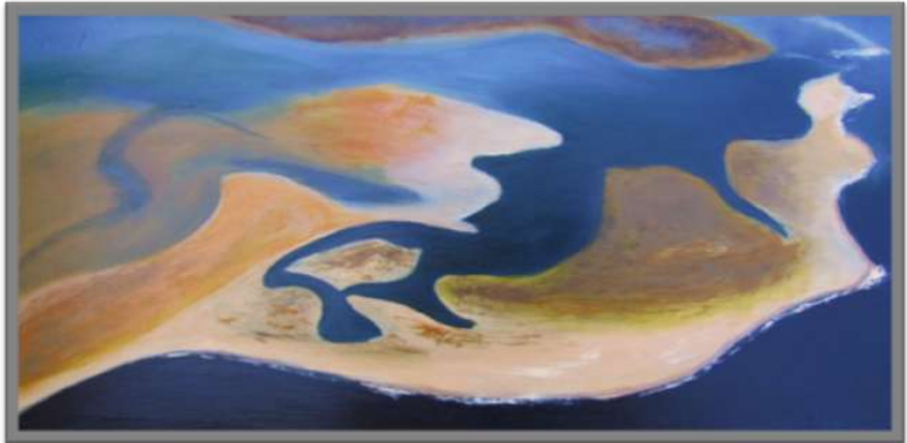
South Beach Abstract , oil on canvas by Porter Lewis ©2012