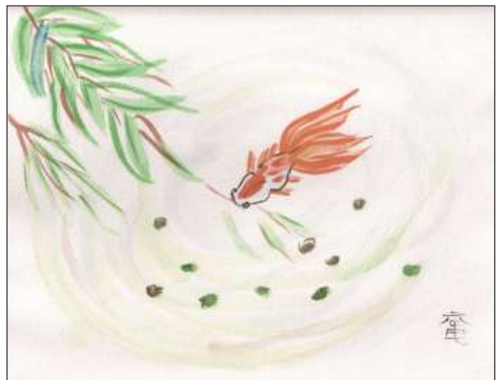
Koi in a gentle pool by Judith

Church of the Holy Spirit 204 Monument Road Orleans, MA 02653 (508) 255-0433 www.holyspiritoforleans.org