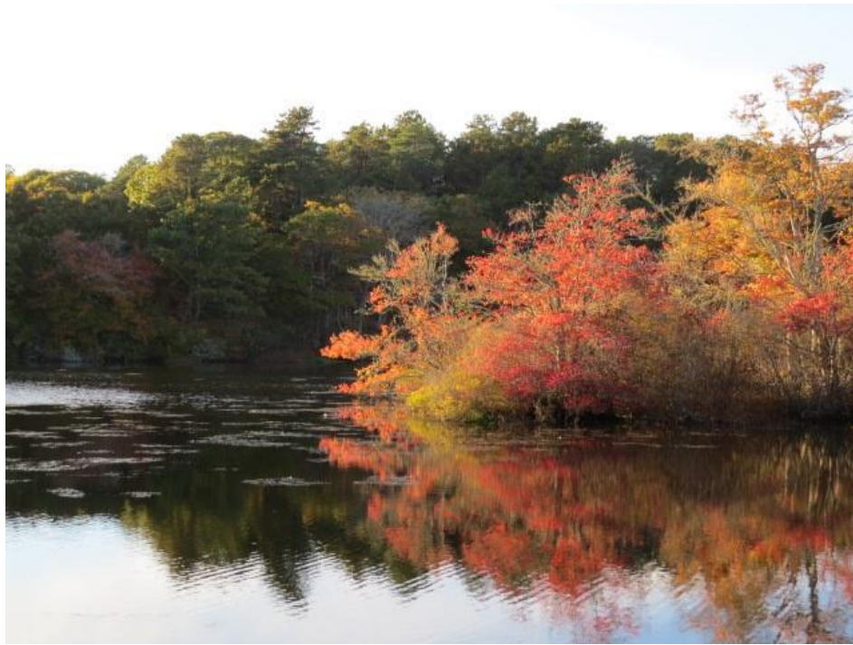
Autumn on Cape Cod