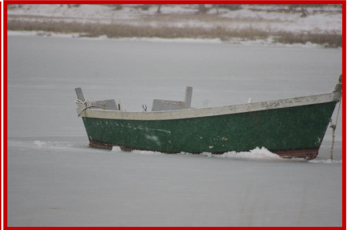
Surely Spring will come soon!

A newsletter of Christ Church Episcopal-Harwich Port, MA