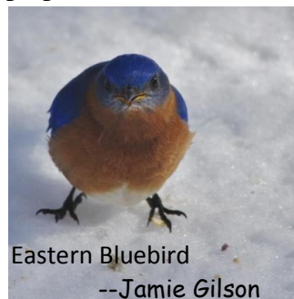
Eastern Bluebird

When we come to Holy Week this year, we are invited to experience Passion week fully with our Palm/Passion Sunday morning worship with special music, Palm Sunday Evensong with special music, the lovely service of Tenebrae on Tuesday, Maundy Thursday dinner with Eucharist, the Good Friday service, and our joyful and festive Easter Day services. If you will join us for all of Holy Week, I believe you will find your lives strengthened and your faith lifted up towards the light the daffodils seek, the light of God's love, joy and peace. Some of you have never experienced the service of Tenebrae (Latin for 'shadows' or 'darkness'), a most unusual service of shadows and light, music and quiet, marked by the gradual extinguishing of candles while a series of readings from Lamentations and The Psalms is chanted or recited. Maybe you have never shared in a Seder-like Maundy Thursday meal in a service we take from the Church of the third century and in which we prepare ourselves for Good Friday. The somber quiet and prayer of Good Friday allow us to focus on the Passion of Christ and our own mortality and life and to recommit our lives to mission in the name of the Resurrected Christ we meet on Easter.