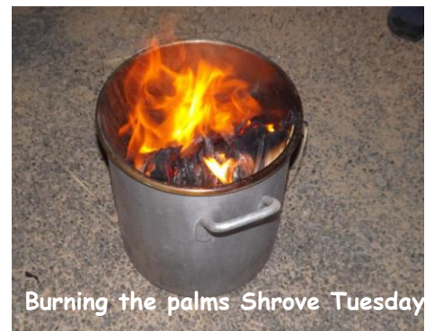
Burning the palms Shrove Tuesday